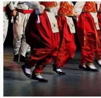
1 Learning traditional Turkish dances,