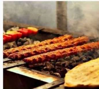
10 participating in an Adana Kebab Workshop to prepare our own kebabs,