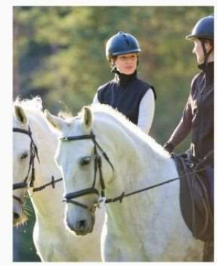
5 Enjoying the thrill of horseback riding,