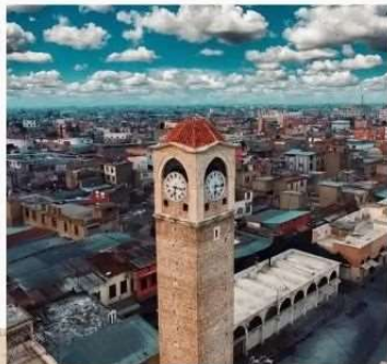
9 The Great Clock Tower (Büyük Saat),