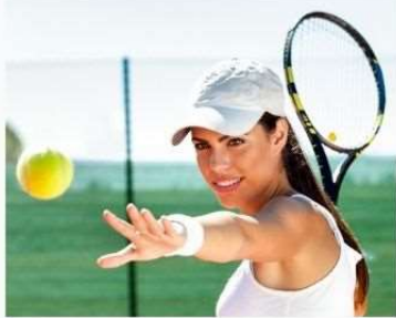
6 Playing tennis,