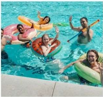
7 Swimming to fully enjoy the summer vibes!