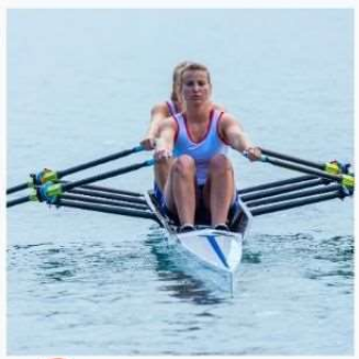
3 Rowing on the Seyhan Dam Lake,