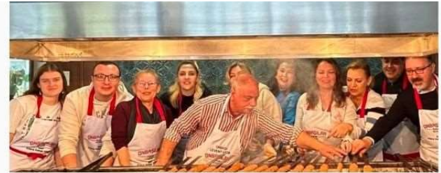
2 Savoring the world-renowned Adana kebab