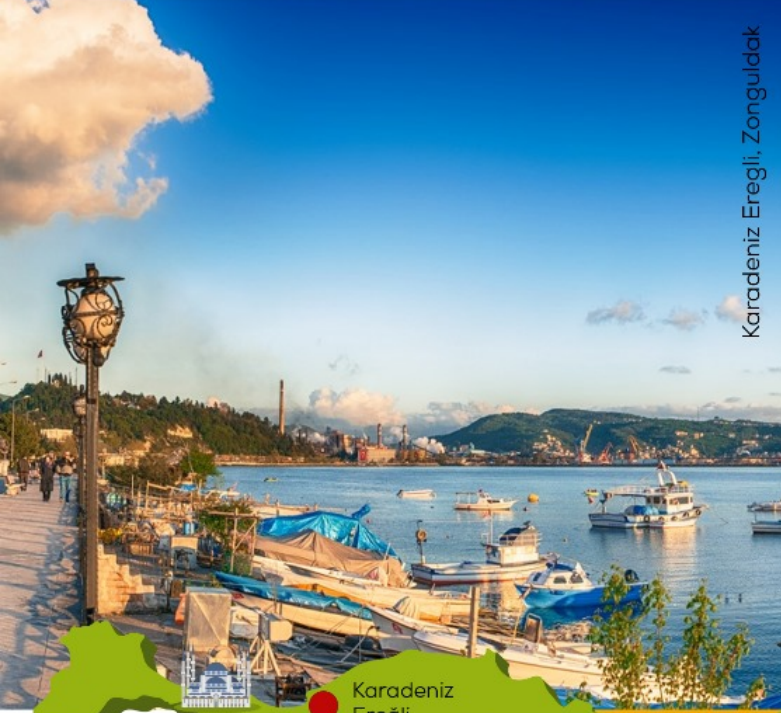
Karadeniz Ereğli, Zonguldak