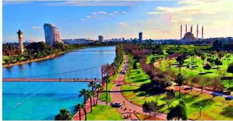
8 Exploring the historical places