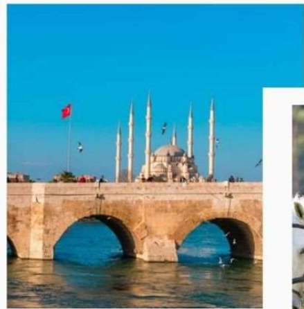
4 Stone Bridge (Taş Köprü)