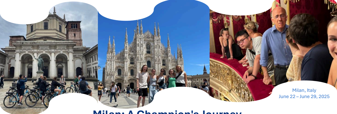
Milan, Italy June 22 – June 29, 2025